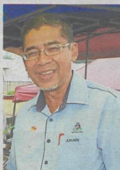
Juhari hopes the free bus service will ease the people's financial burden and reduce traffic.

A total of 6,152 warrants had been issued from April 5 to 30 to property owners with more than RM200 of outstanding assessment tax.