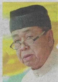
SULTAN SHARAFUDDIN IDRIS SHAH

Jika dahulu orang Melayu 'mengadu' kepada raja-raja Melayu (sebagai khalifah) kerana mencurigai penjajah British, kini mereka terpaksa kembali ke istana 'mengadu' kebimbangan mereka melihat kemelut semasa dalam kalangan institusi wazir.