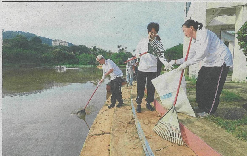
Residents and park-goers scooping out rubbish from Taman Wawasan's lake in Puchong.