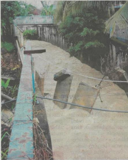
Keadaan hujan menyebabkan arus air semakin deras dan meruntuhkan struktur longkang monsun tersebut.