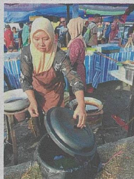
At the Dengkil Jaya Ramadan bazaar, lidded dustbins are a norm.

It is effective as a visit to the Kota Warisan and Dengkil Jaya Ramadan bazaars found the streets devoid of rubbish and indiscrimi-