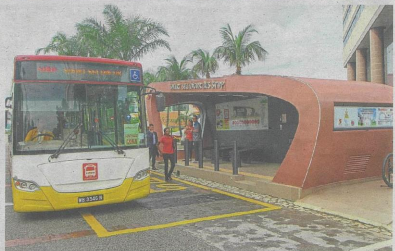
Smart Selangor bus will call at 45 stops in the latest route launched by MPS.

illegal billboards through its regular enforcement.