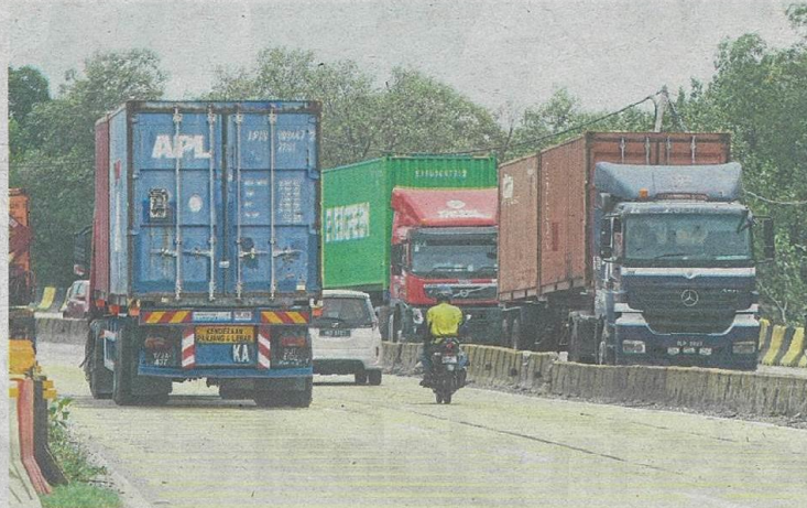
Motorcyclists are especially vulnerable on the Pulau Indah Expressway.

ACP Shamsul said he had proposed several times at the Klang Municipal Council full-