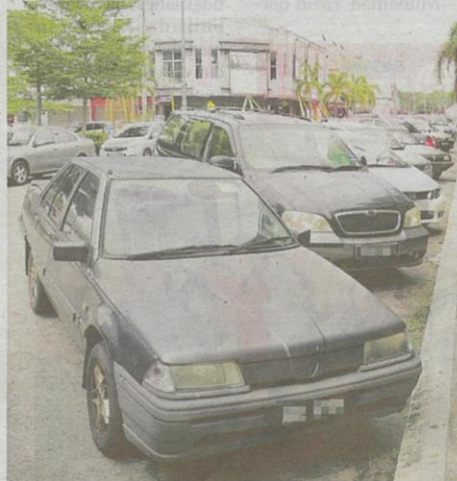
Tempat letak kereta di kawasan premis perniagaan di Kuala Selangor tidak terkecuali dikenakan caj parkir bermula 1 Julai.

Menurutnya, pengguna parkir boleh membuat bayaran tempat letak kereta melalui beberapa kaedah iaitu kupon gores, pas bulanan dan aplikasi telefon