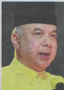
SULTAN NAZRIN MUIZZUDDIN SHAH

Jika dahulu orang Melayu 'mengadu' kepada raja-raja Melayu (sebagai khalifah) kerana mencurigai penjajah British, kini mereka terpaksa kembali ke istana 'mengadu' kebimbangan mereka melihat kemelut semasa dalam kalangan institusi wazir. Mereka merasakan kedudukan dan hak mereka sudah tidak lagi terjamin. Orang Melayu merasakan perbalahan dalam kalangan institusi wazir bangsanya, menggugat kedudukan agama Islam, ekonomi mereka kembali tercicir, agenda pendidikan mereka kembali berclaru dan terpinggir. Malah institusi pertahanan mereka juga terdedah kepada ancaman