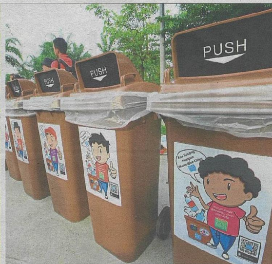
Rubbish bins in Taman Wawasan for recyclable and non-recyclable waste.